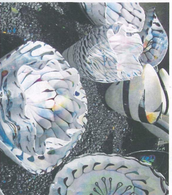
Imaginative ideas for your home, garden, balcony or terrace at a fair where the emphasis is on the Mediterranean and Côte d'Azur

Harmonious colours, elegant lines and a seamless link between indoors and outdoors define the way we want to live these days. Natural materials, craftsmanship and a softly,